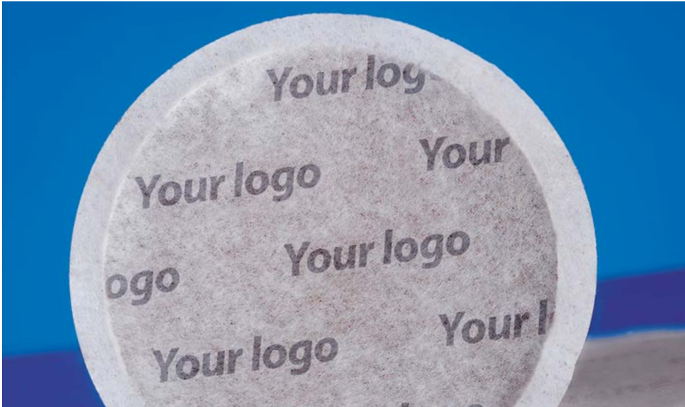
Coffee pad with logo

Emphasize your coffee's mark of quality with innovative branding, excellent processing and exceptional brewing properties.